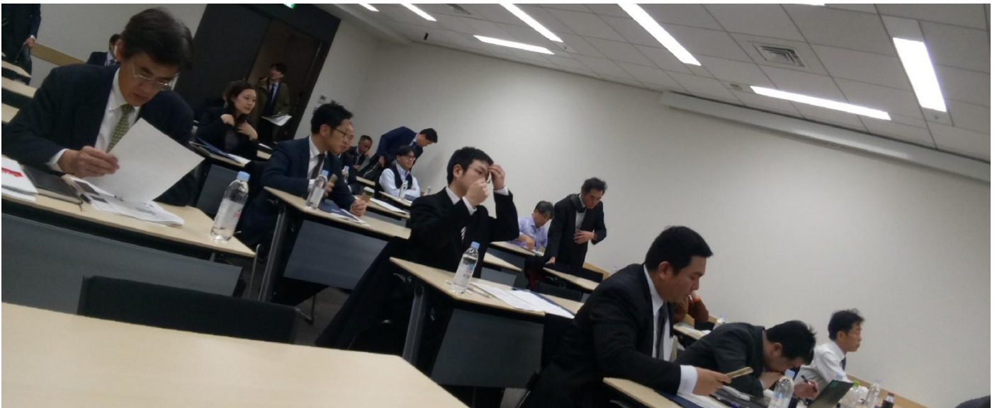
A section of the audience in the VII Seminar by Medius Holdings (Jp) & Medinippon Healthcare (In)